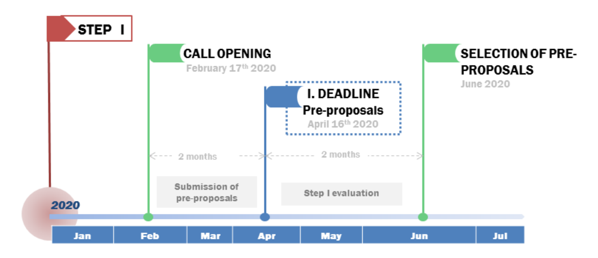
Figure 1: Step 1 process (! New deadline for pre-proposal submission)

The Consortium Coordinator must submit a pre-proposal on behalf of the consortium, providing key data on the proposed project. The deadline for the submission of the pre-proposal is 18.05.2020 , 17:00 CEST (Berlin time).