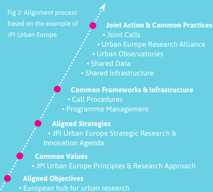
Fig 2: Alignment process based on the example of JPI Urban Europe